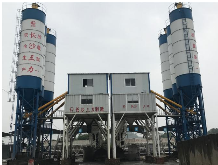
Features of concrete batching plant: